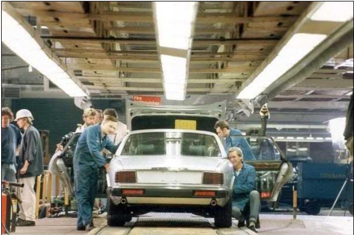
The photo shows the very last XJ6 being finished on the factory floor. The photo was snapped just before major renovation of the Brown's Lane factory that started in 1993.