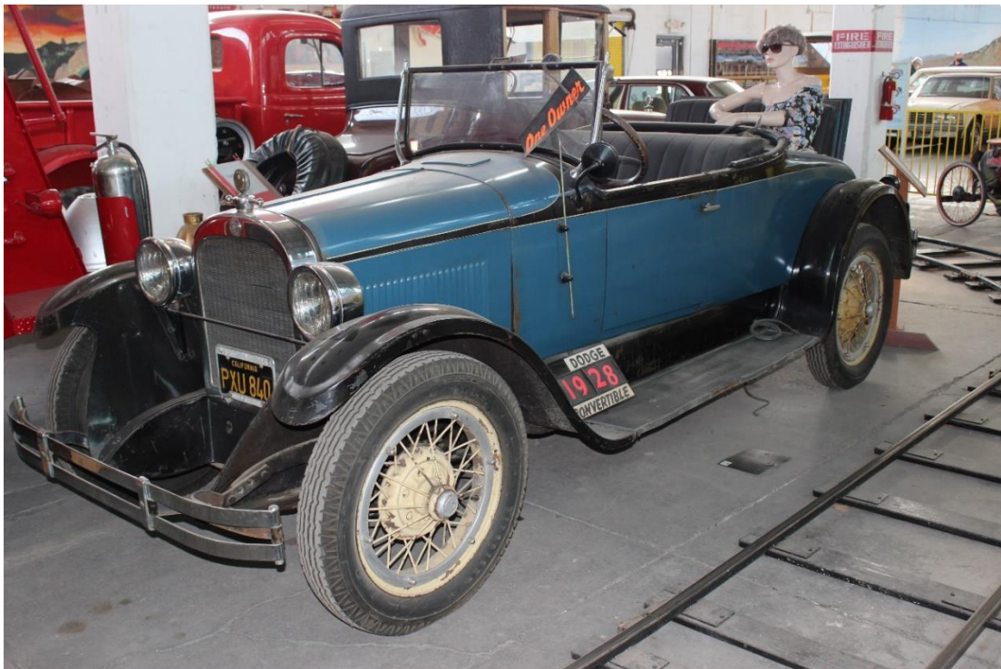
Somebody's girlfriend ... uh ... mannequin was abandoned in the rumble seat of a 1928 Dodge at the Wheels Museum.