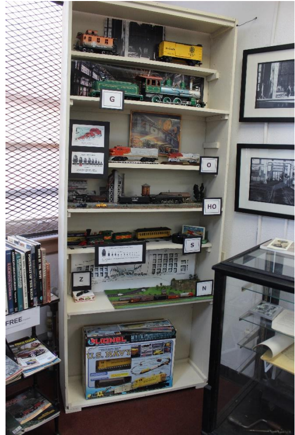
A variety of model trains and cars are on display at the museum.