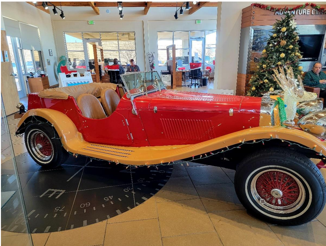
Matthew Sisneros' SS Jaguar 100 replica was also on display at Albuquerque JLR, replete with Christmas decorations that included a lighted reindeer head.