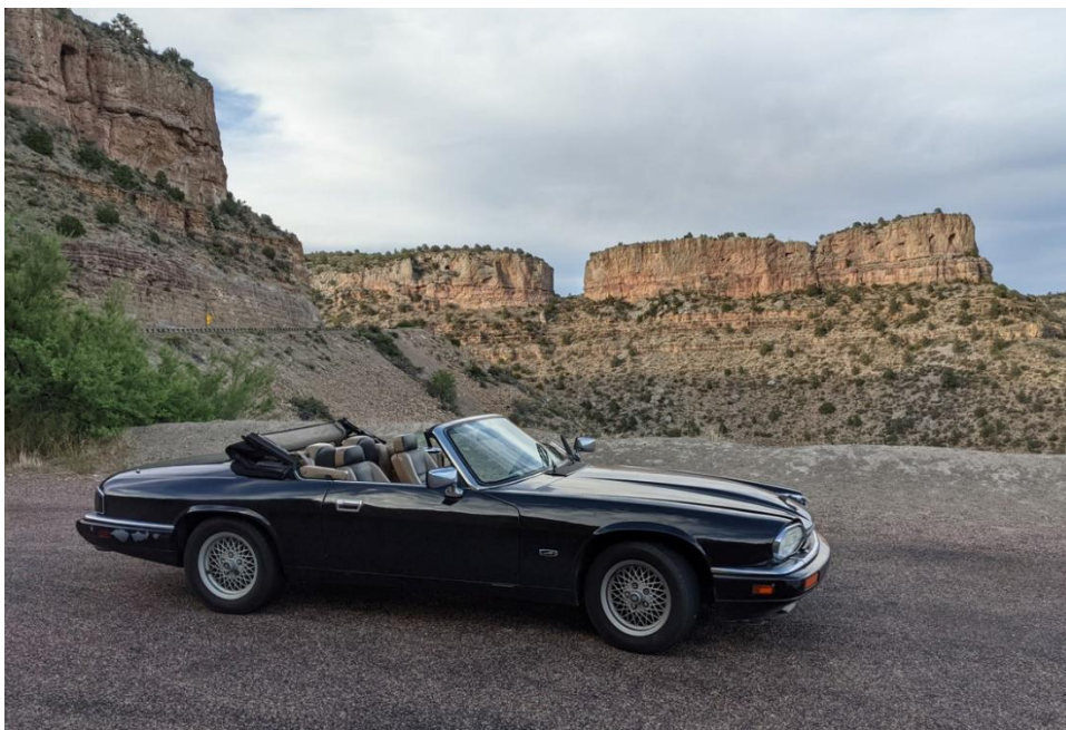
On US Highway 60 in Salt River Canyon, Arizona.