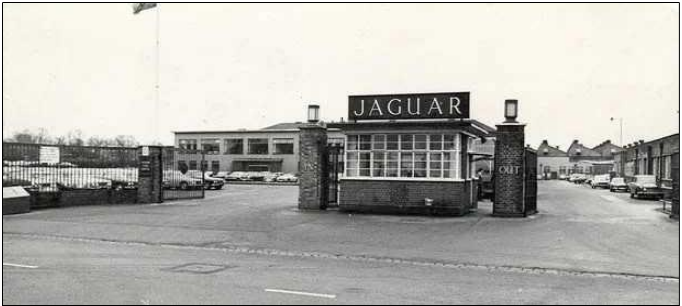
The Brown's Lane factory entrance, December 1972.