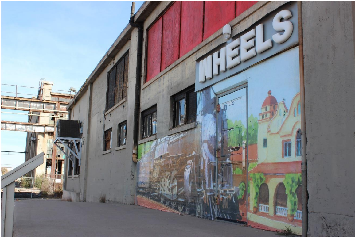
The entrance to the Wheels Museum, located at 1100 2nd Street SW in Albuquerque.