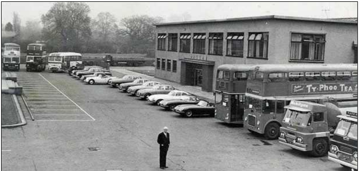
This photo from May 1962 shows Sir William Lyons in the parking lot of Jaguar Headquarters, Brown's Lane, Coventry. He was surrounded by products from all the companies under his ownership: Jaguar Cars, Daimler Cars, and Guy Motors (buses and commercial vehicles).

The following 3 photos may be of interest to readers of the newsletter.