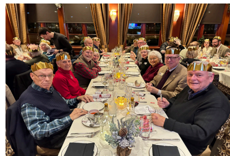
Christmas cont'd pg. 8