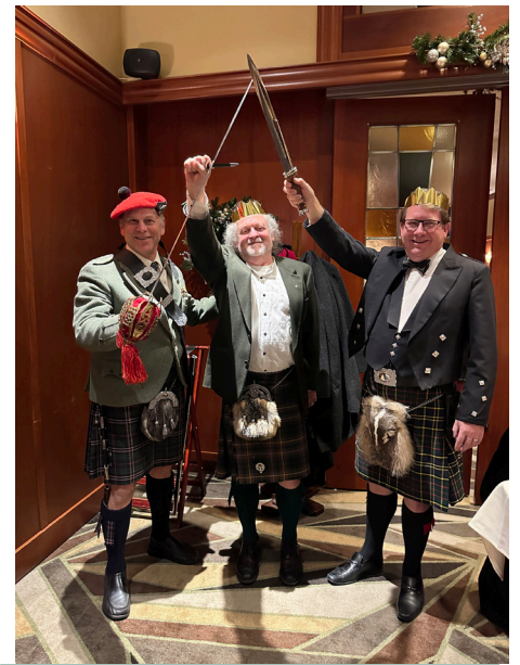
There was a command performance by "The Three Graces of Glasgow" as part of the entertainment.