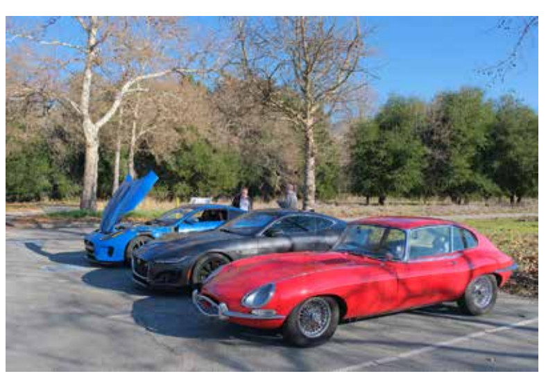
Beautiful history.