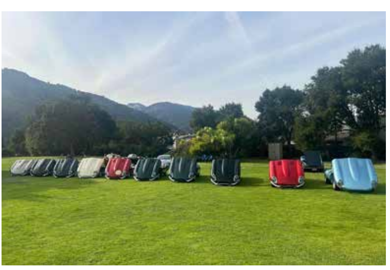
Bonnets up.