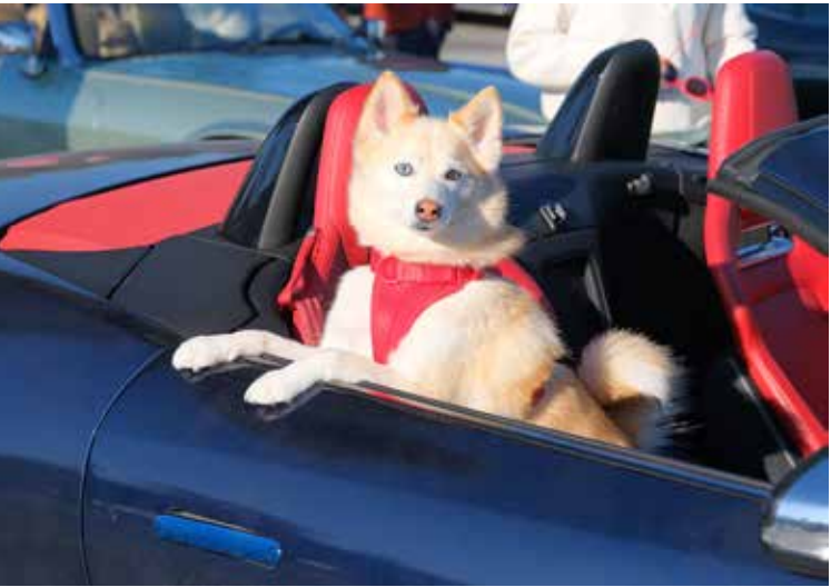
Lucky Gatsby.