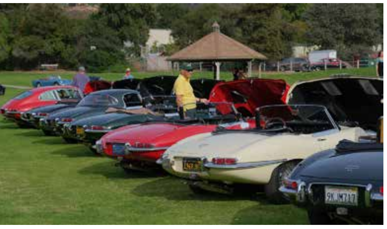
Some of my favorite butts.