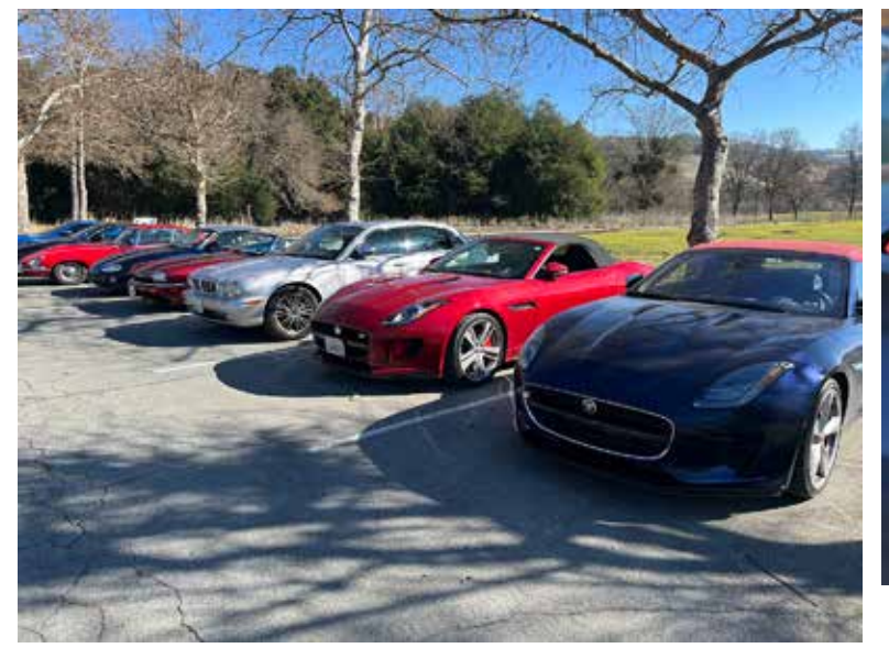
Mighty Purrrrrrty.