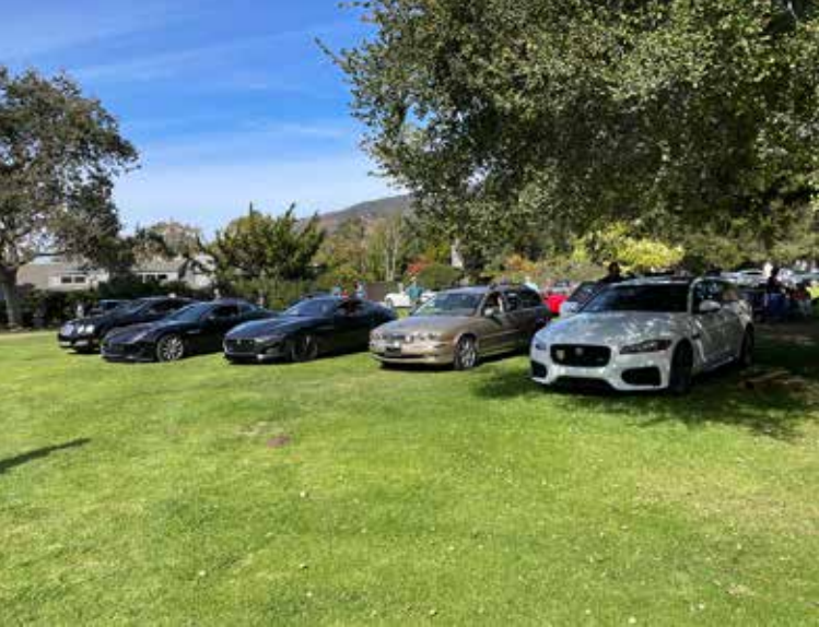
Modern, yet timeless.