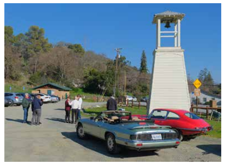
Grrrreat day to have the cats out.