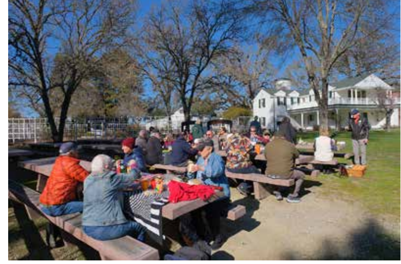
Picnic by the house.