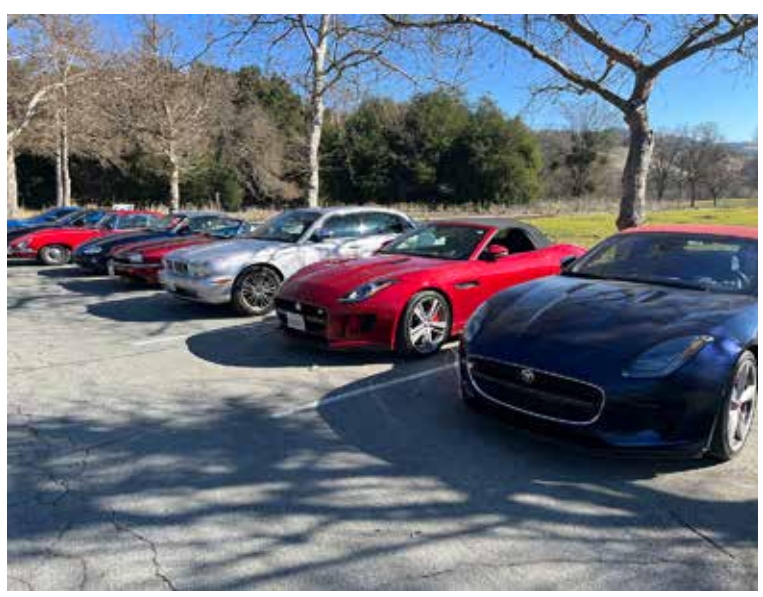
Mighty Purrrrrrty.