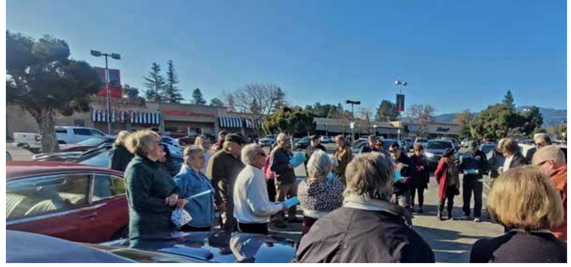
Driver's meeting.