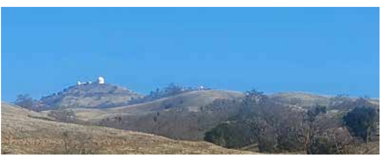
Mt Hamilton.