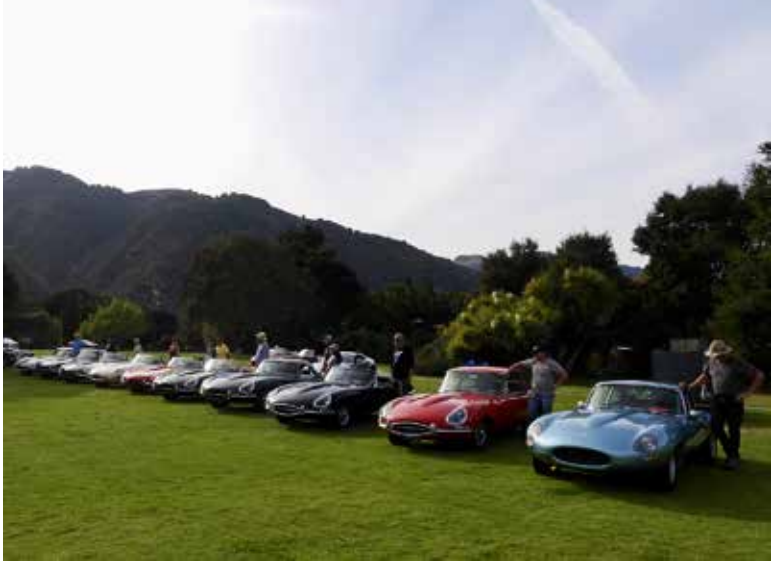
Excellent E lineup.