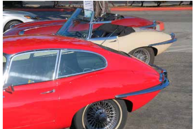
E is one of my favorite letters.