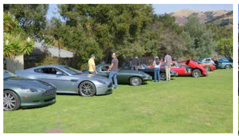
A nice British queue.