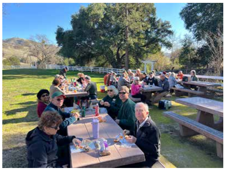
Mt Hamilton picninc.