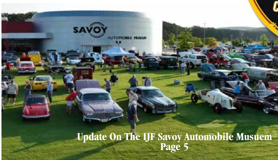
Update On The IJF Savoy Automobile Musuem Page 5