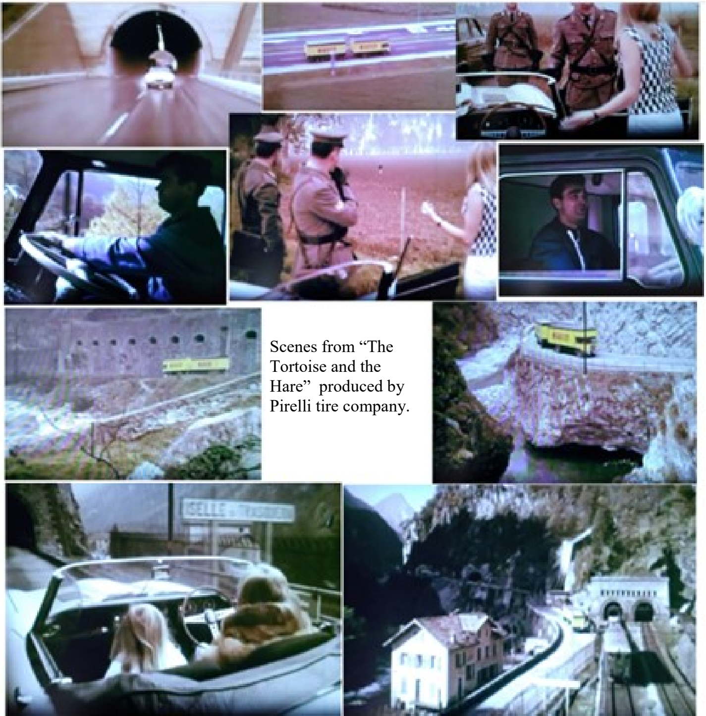
Scenes from “The Tortoise and the Hare” produced by Pirelli tire company.

Check out this 37-minute video at https://www.cinturato.net/tortoise-and-hare.html .